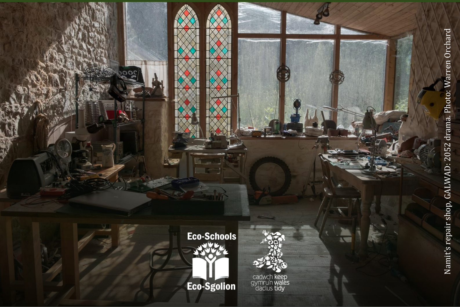
Namit's repair shop, GALWAD: 2052 drama.

LEARN ABOUT OUR PLANET'S LIMITED RESOURCES AND TRY TO CREATE A PARTY WITHOUT USING MONEY